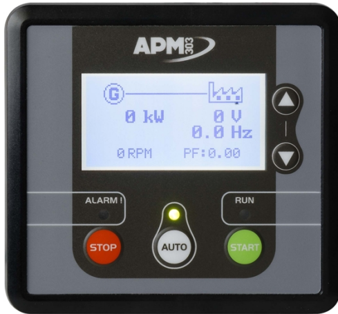
APM303, comprehensive and simple

The APM303 is a versatile unit which can be operated in manual or automatic mode. It offers the following features: Measurements: phase-to-neutral and phase-to-phase voltages, fuel level (In option : active power currents, effective power, power factors, Kw/h energy meter, oil pressure and coolant temperature levels) Supervision: Modbus RTU communication on RS485 Reports: (In option : 2 configurable reports) Safety features: Overspeed, oil pressure, coolant temperatures, minimum and maximum voltage, minimum and maximum frequency (Maximum active power P<66kVA) Traceability: Stack of 12 stored events For further information, please refer to the data sheet for the APM303.